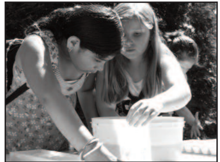
Students get a hands-on experience during our Pond Life program.