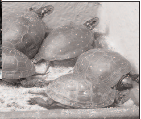
Right: Spotted Turtles