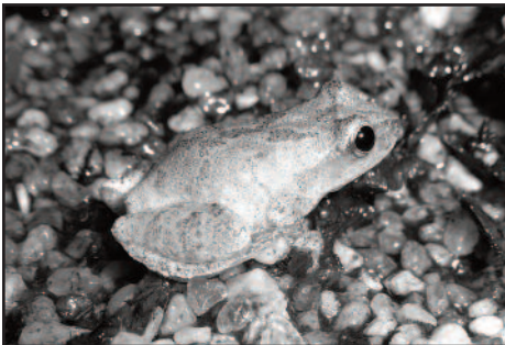
Above: Northern Spring Peeper