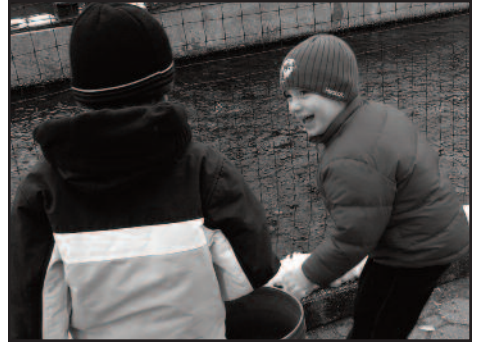
Excited visitors feed the hungry trout.