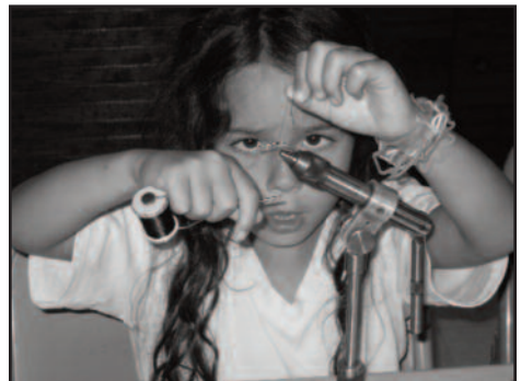
Learning the art of fly tying during summer enrichment programs.