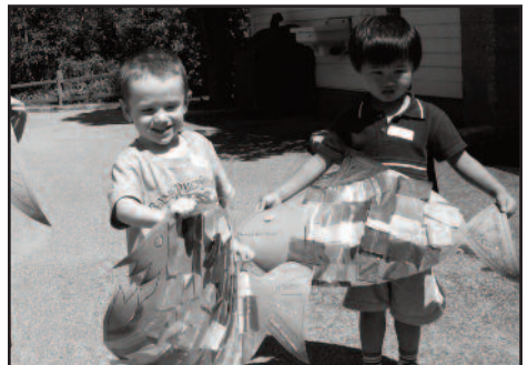
Students create their own fish during Close Encounters of a Natural Kind.