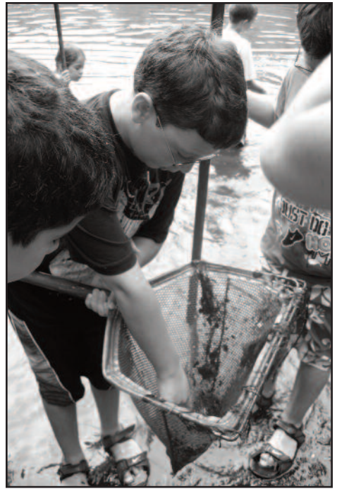
Students search for tadpoles during the Hatchery's Field Explorers program.