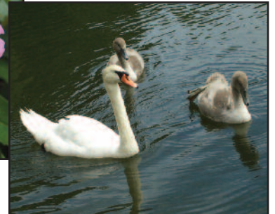
Photos taken by students during this summer's Nature Photography Workshops taught by professional nature photographer Michael Fairchild.